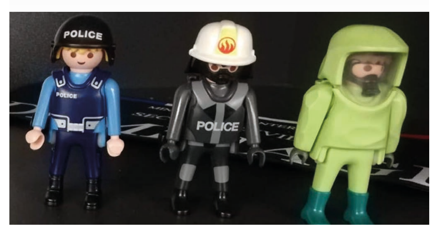
Kick-off meeting TRANSTUN, Lyon, 2019

In this context, SAFE is configured as a support body for decisions and for the practical and operational implementation of policy lines decided in the political and legislative seat. Ultimately, SAFE works hard to make CBRNe research less expensive, more widespread and interconnected, breaking down the barriers between public and private actors and encouraging collaboration in the CBRNe industrial fabric, combatting fragmentation.